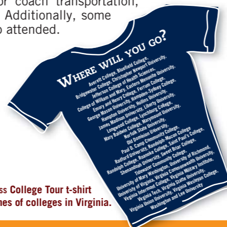
The official Access College Tour t-shirt displays the names of colleges in Virginia.